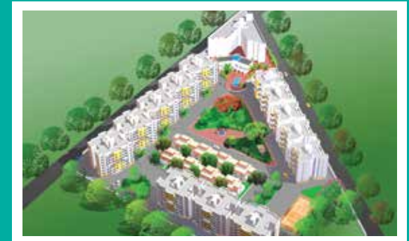
Elite Empire, Balewadi