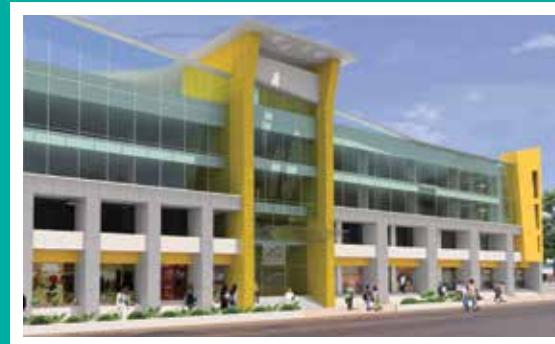
Elite Premio, Balewadi