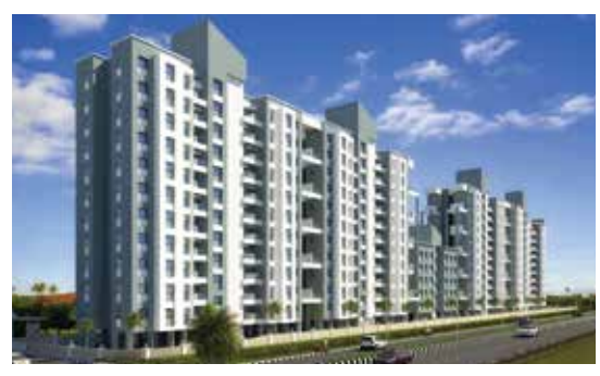
DNV Arcelia, Ravet