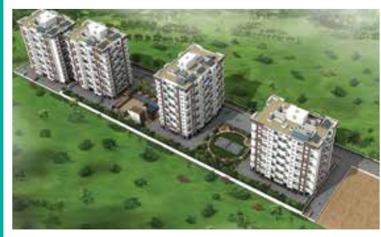
Elite Homes, Tathawade