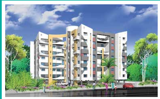
Elite Galaxy, Bawdhan