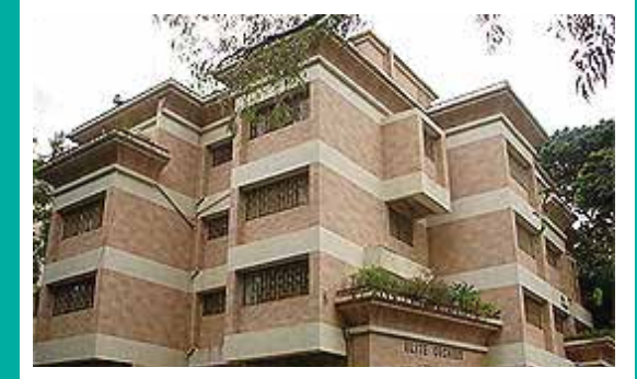
Elite Orchids, Aundh