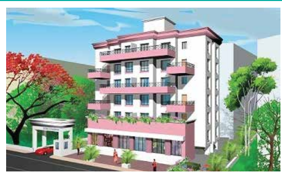
Elite Gardens, Aundh